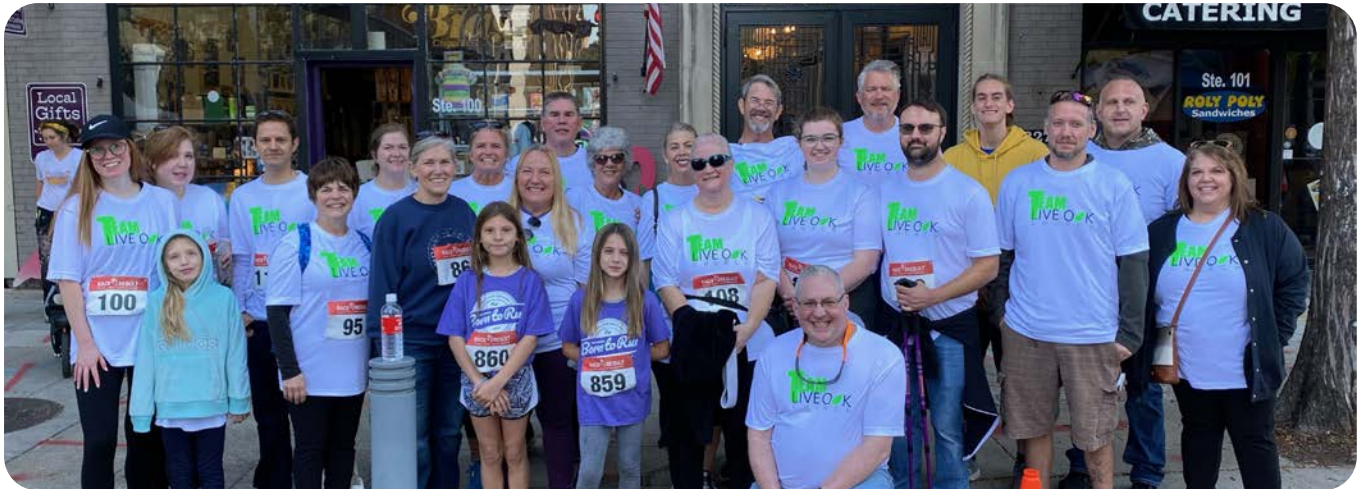
On Saturday, November 4, 2023 a team from Live Oak Church joined the Woman's New Life Clinic's Annual Born To Run event in Baton Rouge. WNLC is a life-affirming counseling and medical clinic that serves women facing unplanned pregnancies in the Greater Baton Rouge and New Orleans areas.